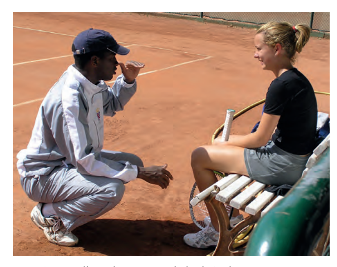
Captains are allowed on court to help their players

As there are no junior members of any IC in the 16-and-under age group, ICs would be required to liaise with their Federations to nominate team members. This would be a valuable interaction for both.