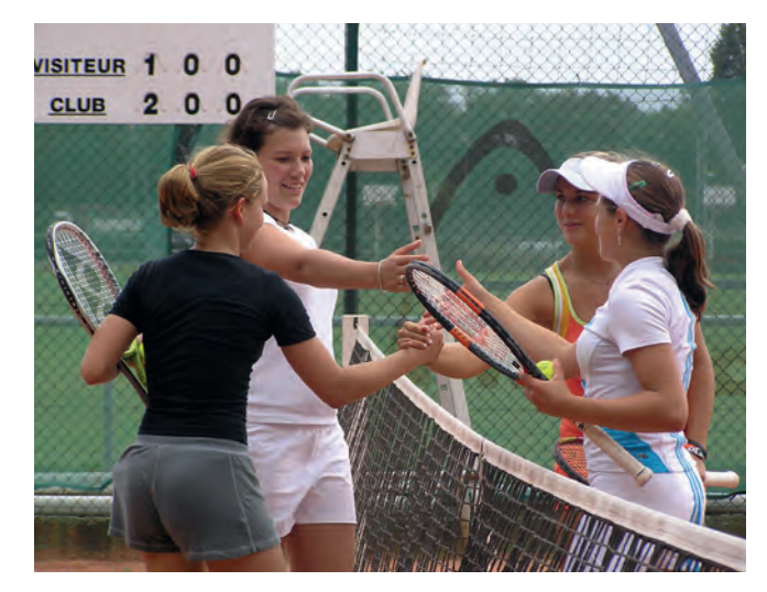
"Hands across the net ..."