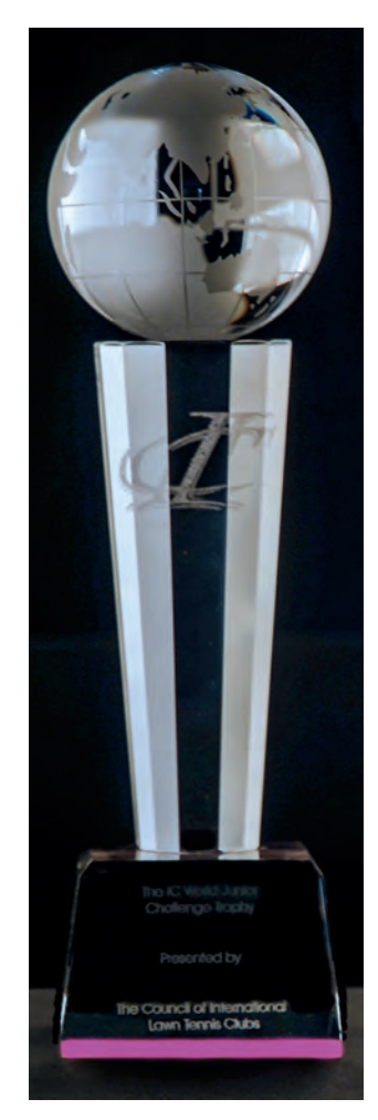
The International Lawn Tennis Club Council's Worldwide Junior Challenge Trophy