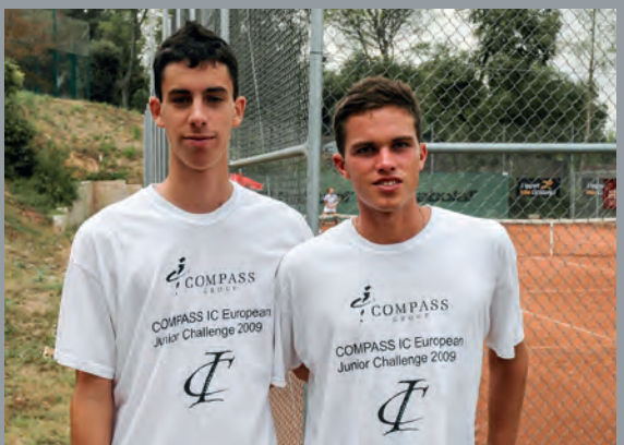
Top: Barcelona girls' doubles and the artistically designed week's programme. Above: Doubles pair in the 2009 Compass IC European Junior Challenge in Barcelona