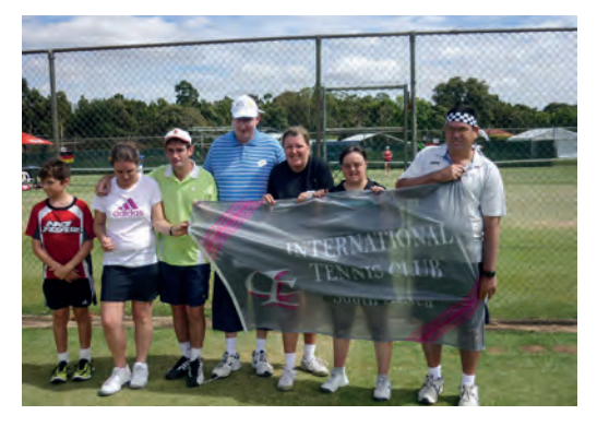
An under-privileged kids' clinic in Adelaide

The youngsters taking part in the events are not usually drawn from the very top echelon of juniors. At the very top, the players receive substantial grants and/or sponsorship from their Federations to compete in tournaments all over the world, and