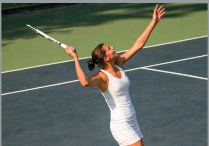
Top: Local dancers saved from the Sri Lankan tsunami perform for the juniors. Above: Action from the 2010 New Delhi Worldwide Finals