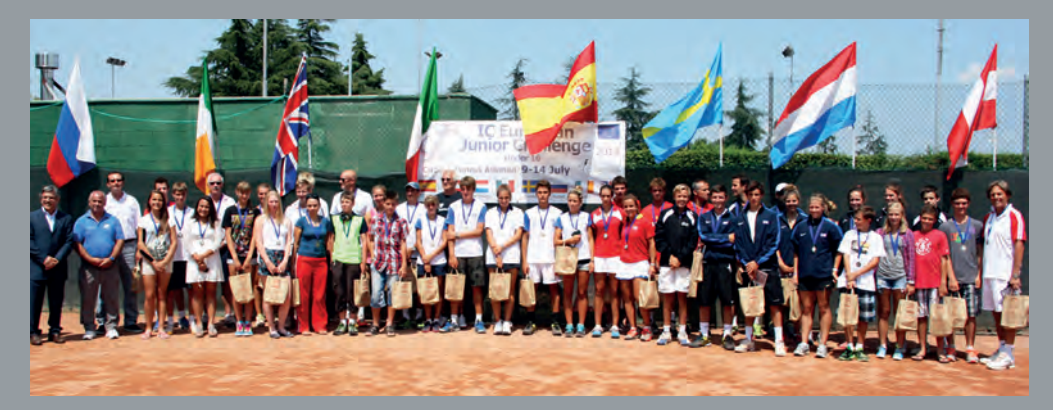
Above: The Albinea competitors and coaches. Top: Action from the Compass European Junior Challenge in Albinea