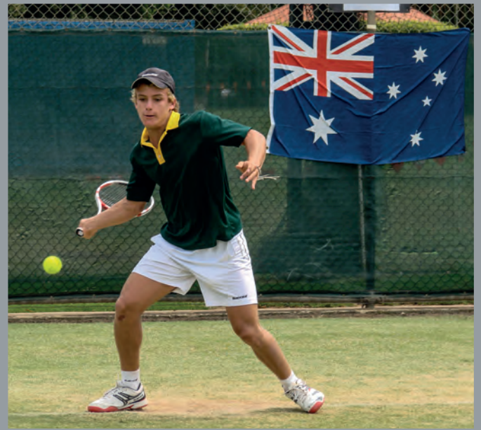
Top: Competitors wear Pat Cash headbands in Adelaide. Above: A South African player in action in the 2012 Worldwide finals