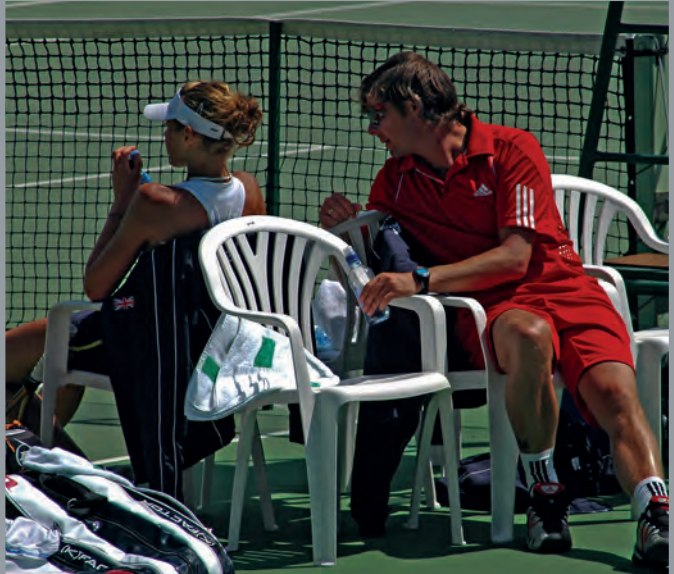
Top: Action from the 2014 Worldwide Finals at the ASB Stadium in Auckland