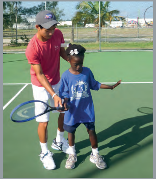
Top: Competitors and recipients of the disadvantaged clinic in the South American Junior Challenge in Chile. Above: Tuition from a competitor in the North American and Caribbean Junior Challenge in The Bahamas