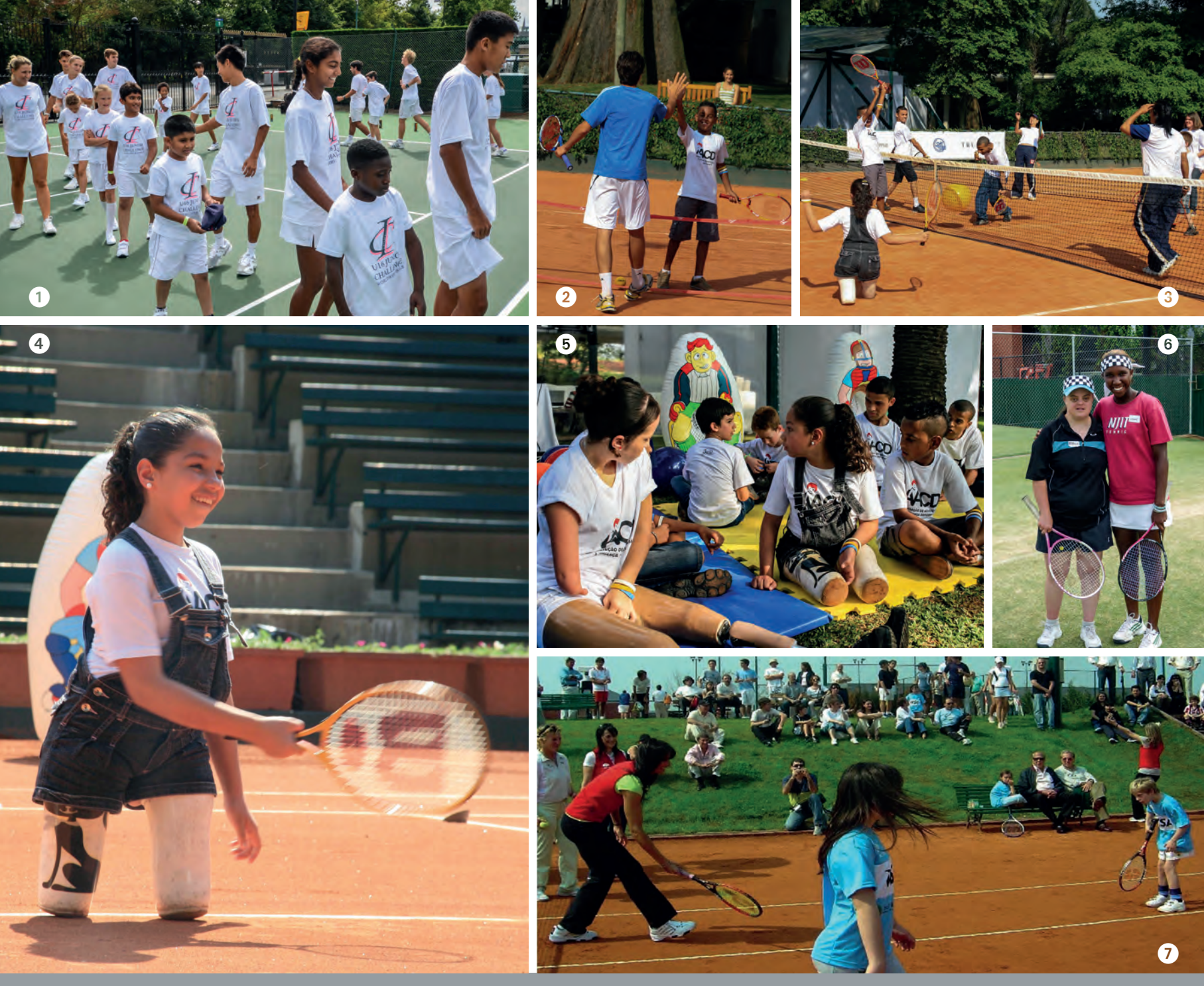
The Development of Disadvantaged Kids .11 \mathcal{L}